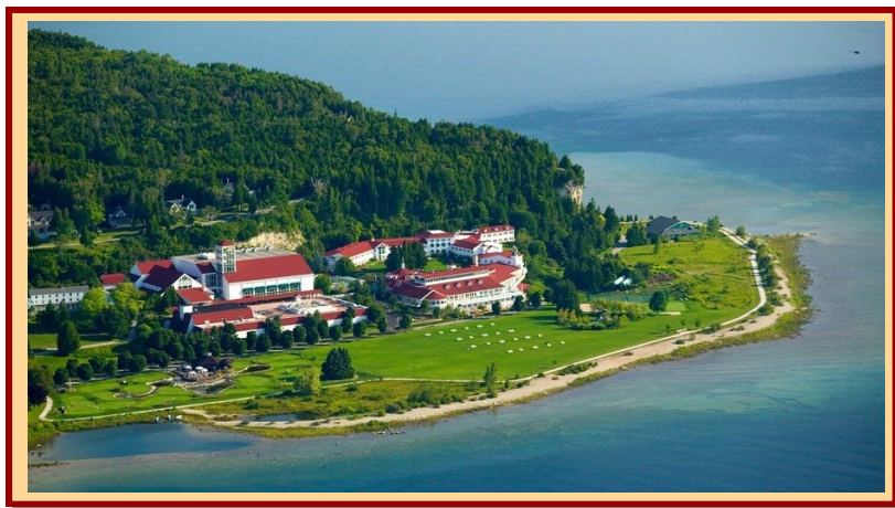
The Mission Point Resort, location of the MAFS Super Bowl of QD Workshops and the Dream Team of Instructors.

Information about the meeting may be found at www.mafs.net , and registration opens around June 1 st .